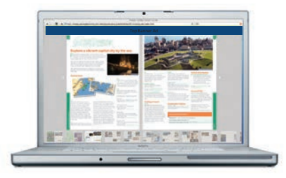
Flipbook Top Banner 2500 x 60 pixels

Capture the attention of customers on standard computers by purchasing a banner ad or by adding audio or video to your print ad and directing viewers to your website or promotional landing pages.